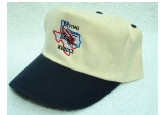
NAVY & NATURAL