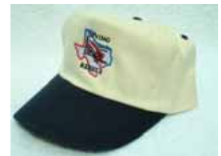
NAVY & NATURAL