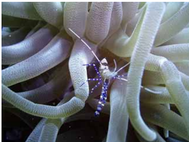
Peterson Cleaner Shrimp