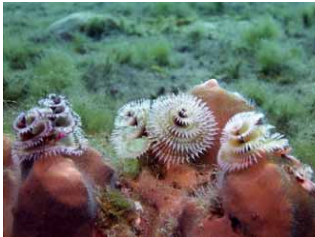
Christmas Tree Worms