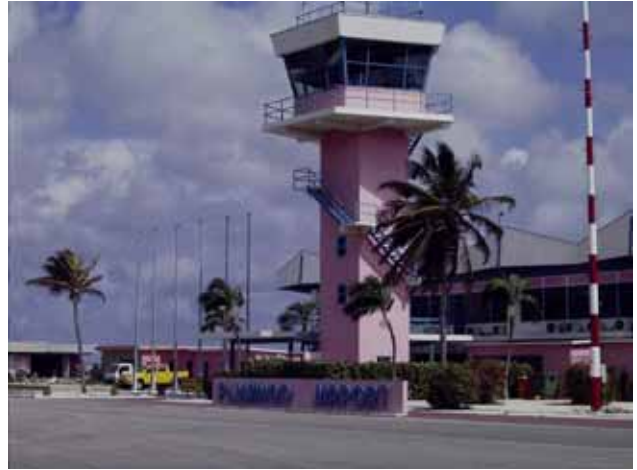
Bonaire's Flamingo Airport