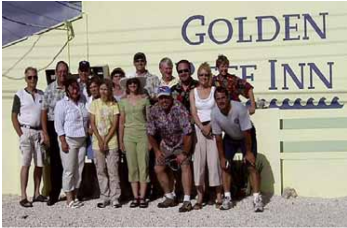
Diving Rebels on Bonaire