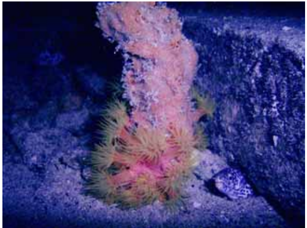
Town Pier Night Dive