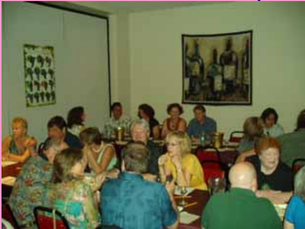
Tony's Wine Warehouse

Thirty-seven Diving Rebels Members and friends enjoyed an evening of Wine Tasting at Tony's Wine Warehouse on Oak Lawn Ave in Dallas on Saturday, September 29 th . The Wine Tasting was followed by an enjoyable meal at Bellini's Restaurant immediately following. The group tasted 12 wines from Italy, California, and Chile and many found wines that were quite to their tasting. Here are a few pictures from the evening of fun and camaraderie.