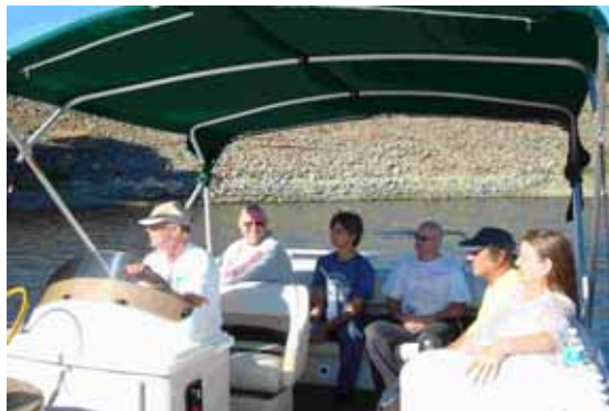
A boat ride by the Dam