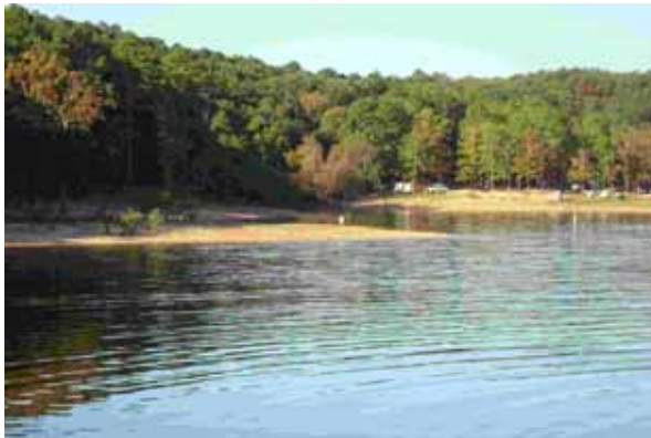
The Lake from the Campsite