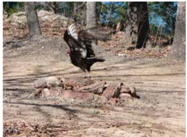
After the party, the vultures rule