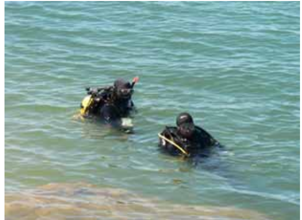
Cold water, but an enjoyable day