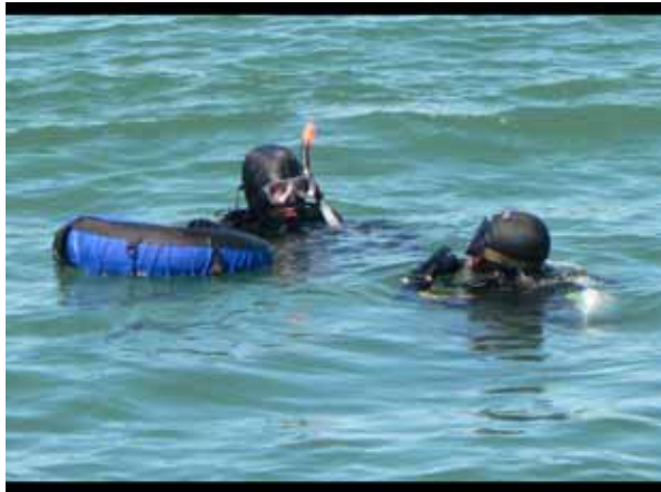
45 degrees at the surface, 43 degrees at 51'