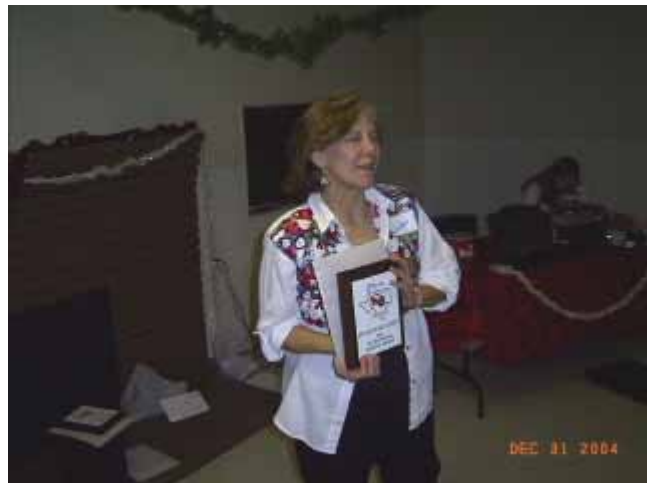
Linda Magnuson Service Award