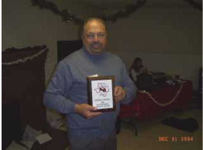
Steve Ogden Service Award