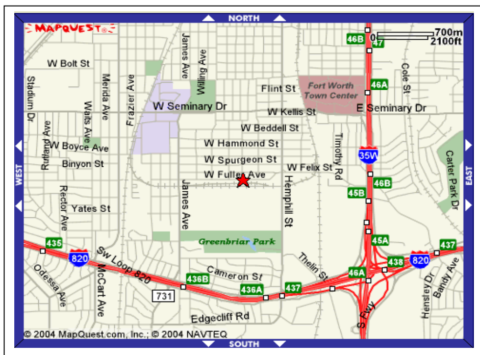
Map to Herman Son's Lodge