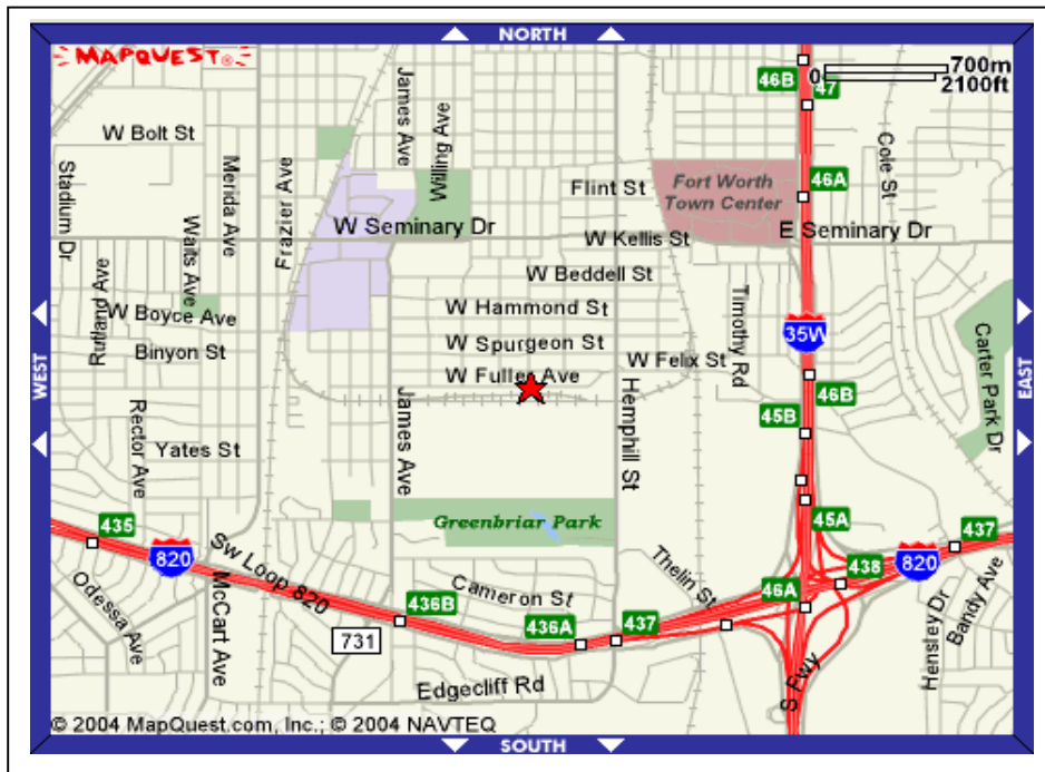
Map to Herman Son's Lodge